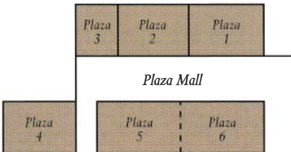
First Floor Plaza Rooms (directly below Atrium Rooms)